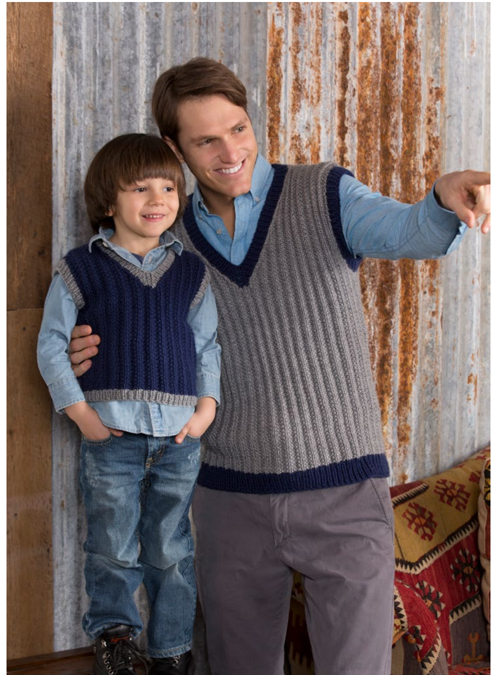
Child vest see LW4270